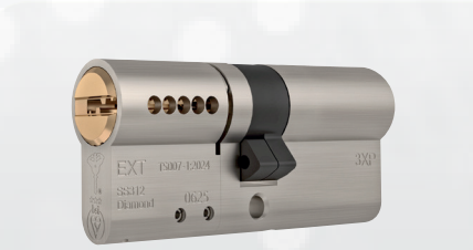
Euro Profile Key & Key Cylinders

The MTL™300 Break Secure® 3XP Pro master key solution is backwards compatible and is part of our MTL™300 platform. Give your customers more than just peace of mind; MTL™300 Break Secure® 3XP Pro provides the ultimate combination of security with the latest cylinder technology and a patented master key system for total access and key control.