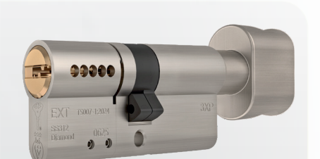
Euro Profile Key & Turn Cylinders