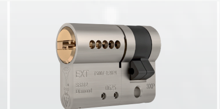
Euro Profile Single Cylinders