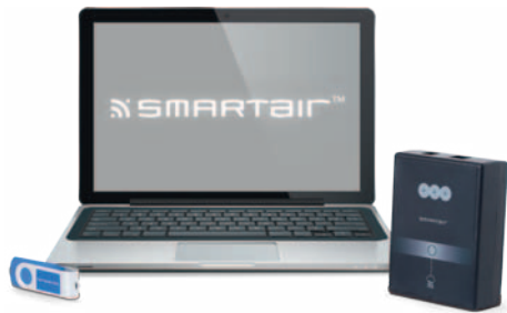
PC, software and card encoder