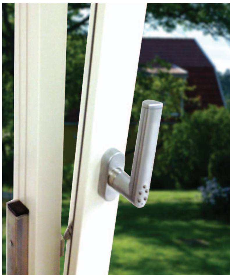
Ventilation mode (locked or unlocked)