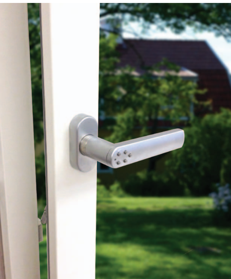
Open / unlocked